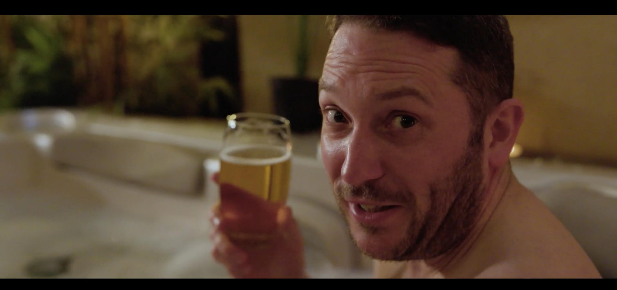
Remember the Royal Bank of Scotland?